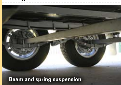
Beam and spring suspension