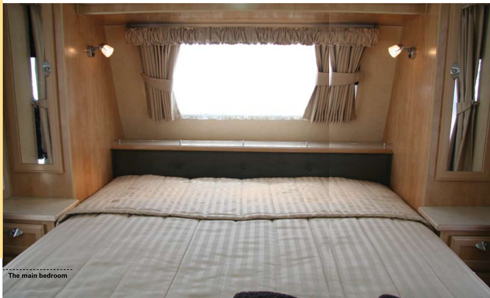
The main bedroom

The Royal Flair Family Flair fits right into this holiday category.