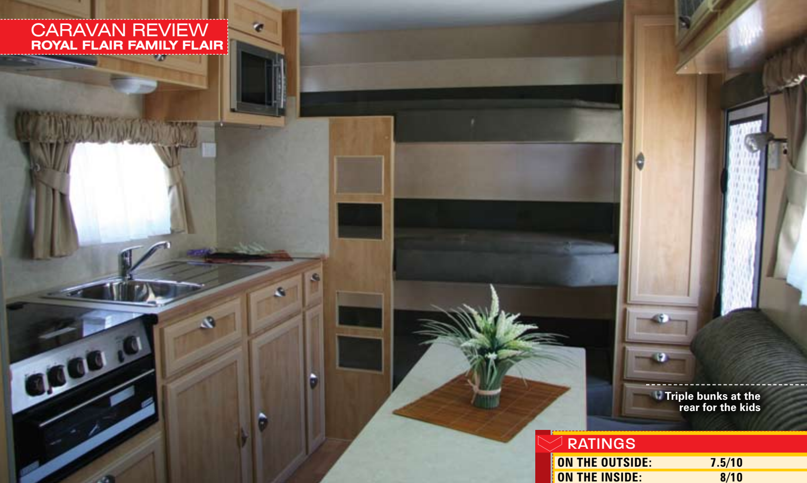
Triple bunks at the rear for the kids

There is some storage under the lounge, and a set of leadlight glass door lockers above. There's a handy shelf at the door end of the overhead, and a neat idea is a shelf under the forward end where a Playstation II is fitted.