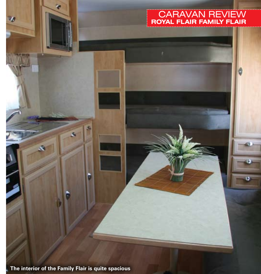
The interior of the Family Flair is quite spacious

The kitchen is positioned along the driver's side between the bedrooms and is practical enough for a family.