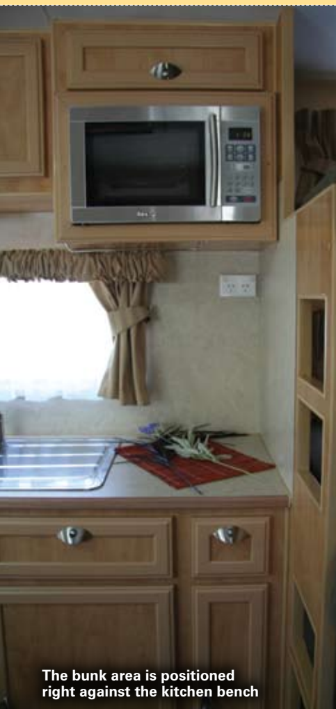
The bunk area is positioned right against the kitchen bench