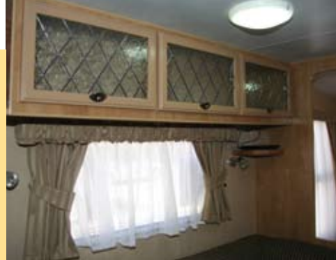
Glass locker doors above the dinette