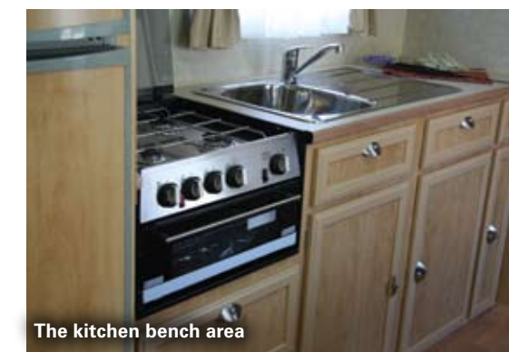
The kitchen bench area

The lounge dinette is an L-shaped layout with a large table. There is ample room here for a family to dine happily and the upholstery is comfortable. It's also a good spot for dad to kick back for a snooze while the kids are out terrorising the neighbourhood.