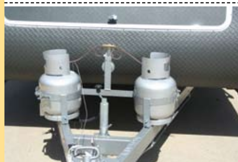
Twin gas bottles on the A-frame