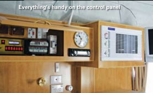
Everything's handy on the control panel