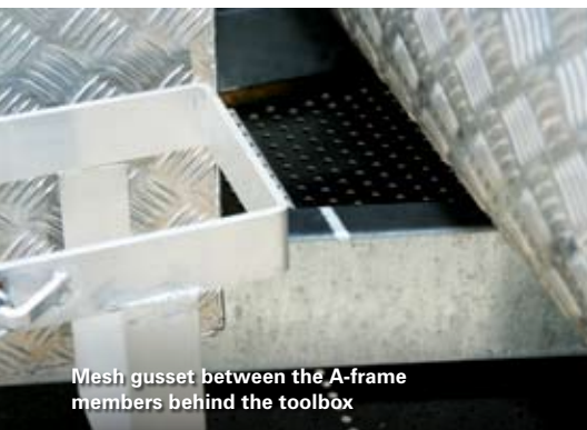
Mesh gusset between the A-frame members behind the toolbox