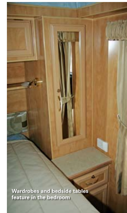
Wardrobes and bedside tables feature in the bedroom

There has obviously been a bit of serious thought put into the Tuff Roder. It certainly looks like it would be at home in the scrub.