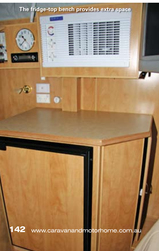
The fridge-top bench provides extra space

I guess it's hard to define just what a 'classic' dirt-road caravan looks like, but the Royal Flair designed Tuff Roder may well be a candidate.