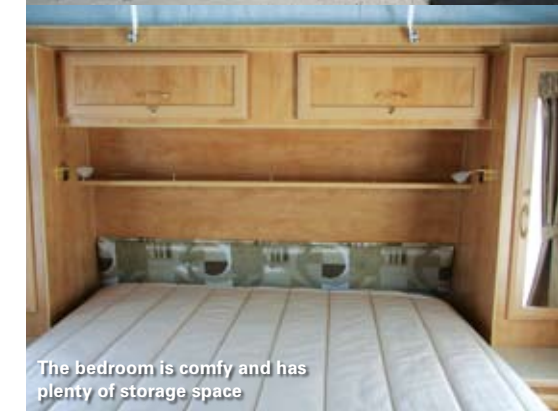
The bedroom is comfy and has plenty of storage space