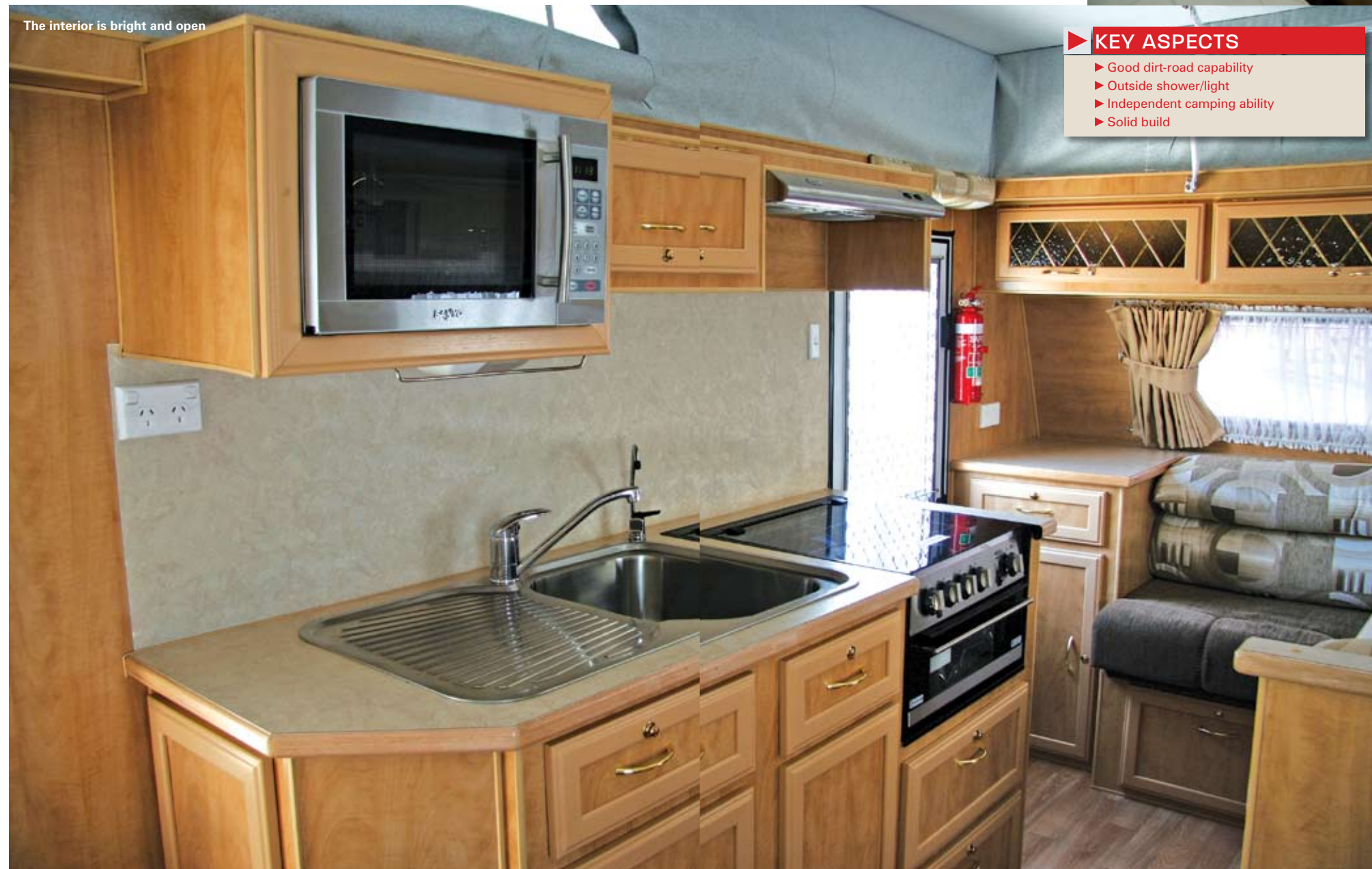
The interior is bright and open