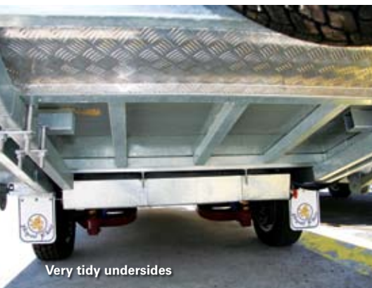
Very tidy undersides